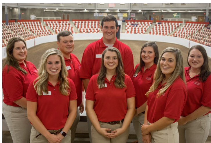
2018-2019 Agriculture Ambassadors