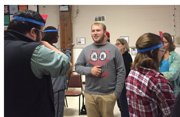
Students at PAH play games to learn new signs.