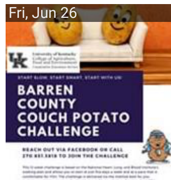
Barren County Couch Potato... Barren County...