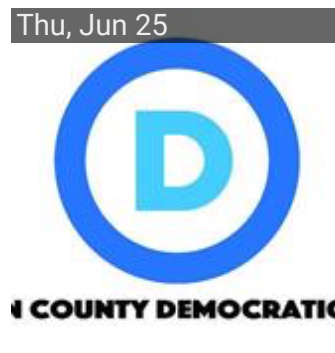
Meeting of the Barren County... First Baptist Church