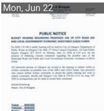
Public Notice Municipal Road Ai... City of Glasgow...