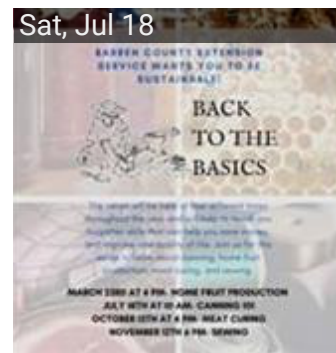
Back to the Basics Series Barren County...