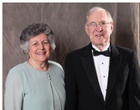
Kentucky Building renamed after former Bowling Green mayor