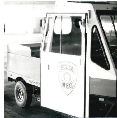
1977 Campus Patrol