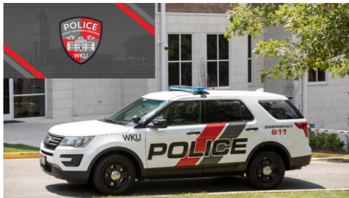
New Police Patch & Cruiser Design