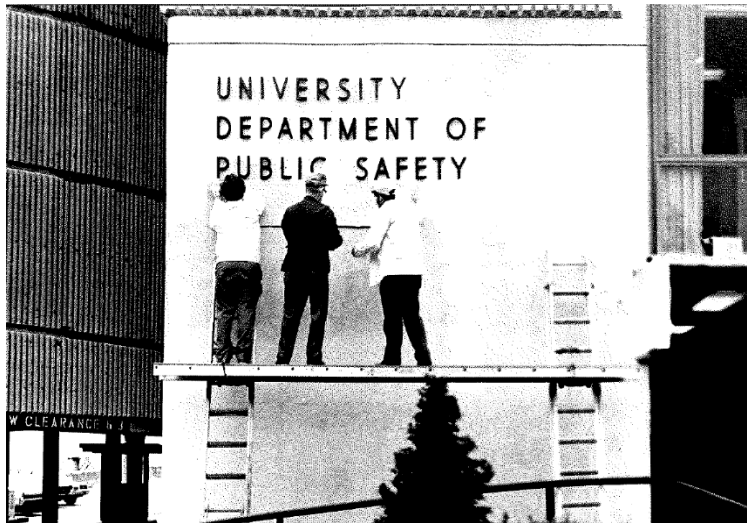
Exterior of department AOC side