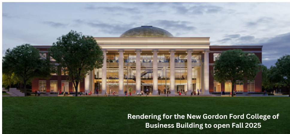
Rendering for the New Gordon Ford College of Business Building to open Fall 2025