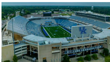
These are the top colleges in Kentucky, report says. See which universities made top 10