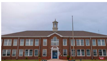
Lexington public high school makes US News & World Report's 10 best in Kentucky